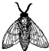
Figure 2: A sample black and white graphic that has been resized with the includegraphics command.